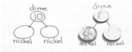
Number bonds with coins

In this final module of the school year, students synthesize their learning from all the other modules, working with the most challenging Grade 1 content. In the first several lessons, students identify and solve various types of word problems. Next, they extend their skills with tens and ones to numbers to 120, both counting and performing addition and subtraction. Finally, they are introduced to nickels and quarters, having already worked with dimes and pennies. The module concludes with fun fluency activities to celebrate their year of mathematical learning.